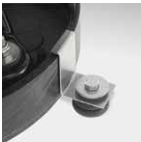
Vibration-isolation mounting clips reduce vibration and noise.

The optional Turbo sound cover provides up to 50% further noise reduction. This compact, easy-to-install sound cover completely encases the compressor to provide a 3- to 5-dB reduction in noise. Available for all Turbo models, the sound cover installs in minutes. Mounting hardware is included.