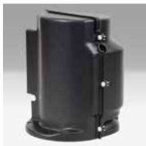
Optional sound cover further reduces compressor noise by up to 50%.